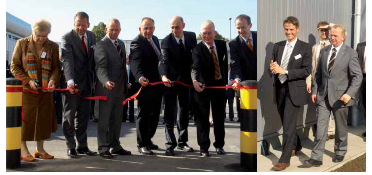
The red tape is cut officially opening the new wastewater treatment facilities