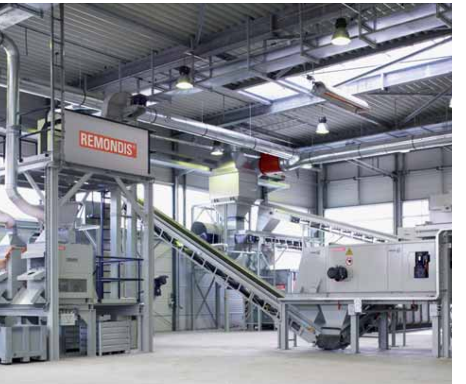
The dismantling centre in Lünen was the meeting place for WEEE experts from all over Europe.

cans, plastic film, wood, residual waste: all the different types of waste produced by this complex show need to be disposed of. Jochen Reinhard, project leader at REMONDIS, commented, "The show in Cologne proved to be a particular logistical challenge as it was held on a boat, the MS Rhein Energie." The waste had to be subtly removed from the boat during the show and taken to a central collection point on the banks of the Rhine. (dartsch)